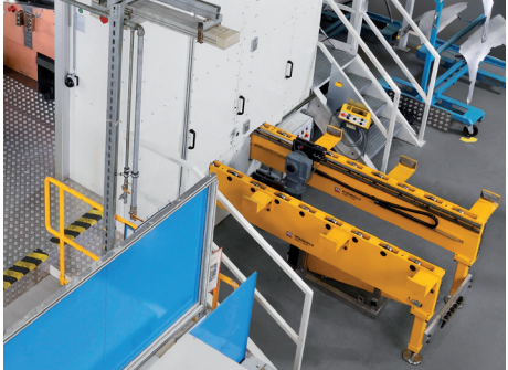
Die changing console with drive and side loading of the press.